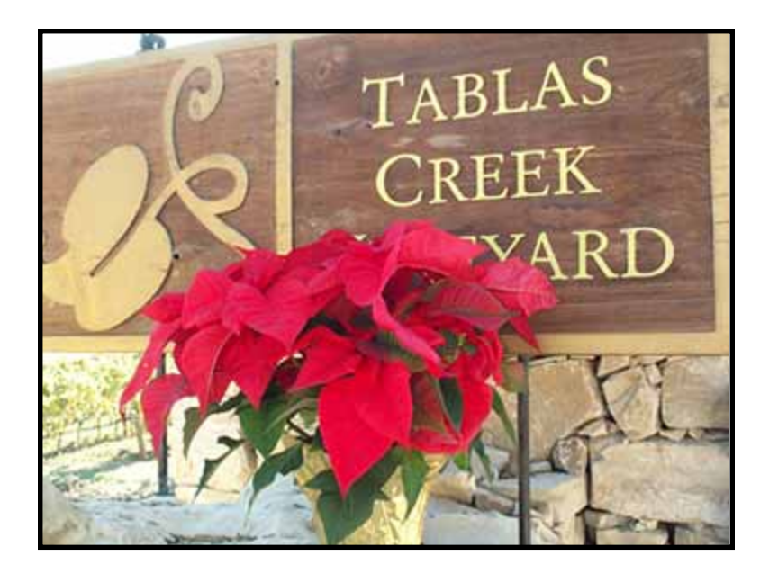
Happy New Year from Tablas Creek Vineyard!