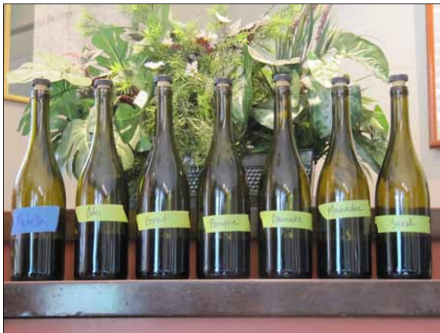
The final blends

It will be a pleasure to get to know these wines over the coming years. 🍷