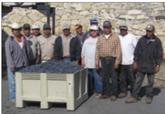
The vineyard crew poses with the last bin of the 2007 harvest.

One technique that we are often asked about is co-fermentation. Because the