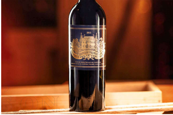
Behind the label: Château Palmer 2011 release - Decanter