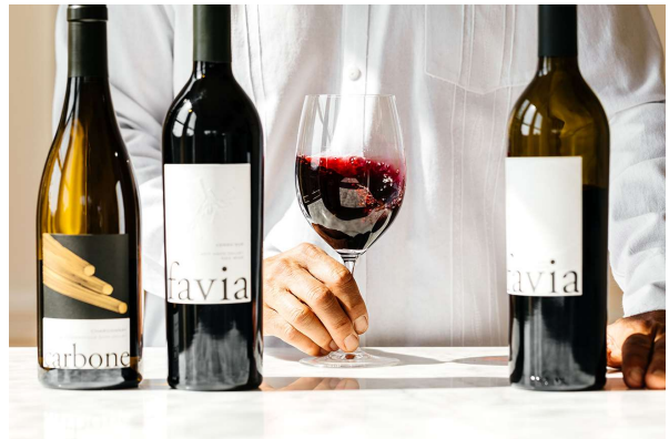
Favia: producer profile and five wines tasted - Decanter