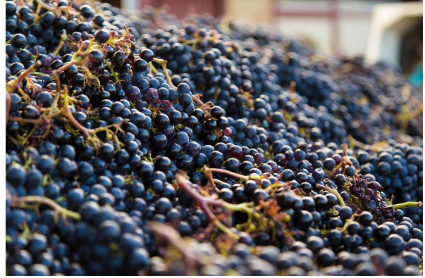
Anson: Bordeaux's single-variety wines under the spotlight - Decanter