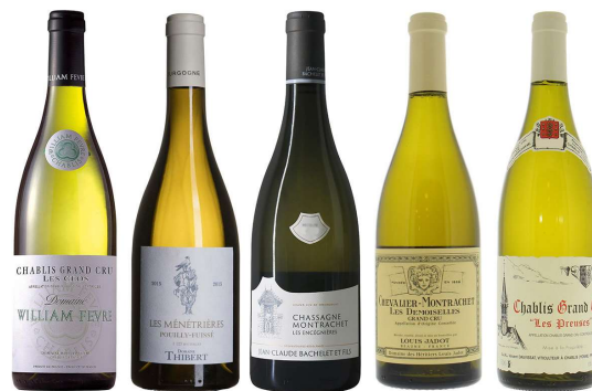
Top five white Burgundy vintages ready to drink now - Decanter