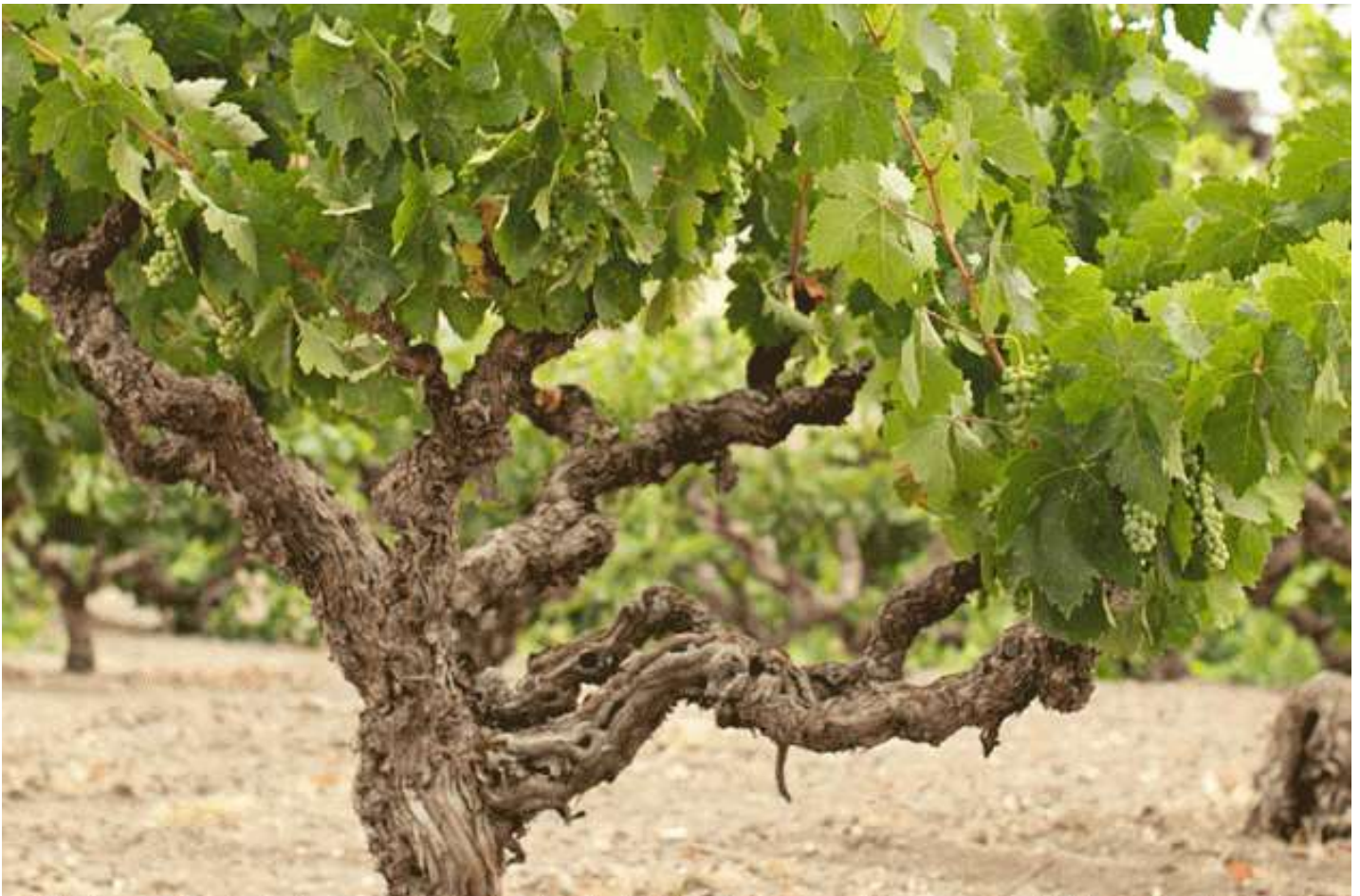
Old-vine, dry-farmed Zinfandel in the Dusi vineyard, planted in 1923.

It continues: ‘Upon extensive research and travel, we kept coming back to Paso Robles for the weather, unique soils, hilliness and extreme temperature swings that are known to this region and found within each of our vineyard sites.’